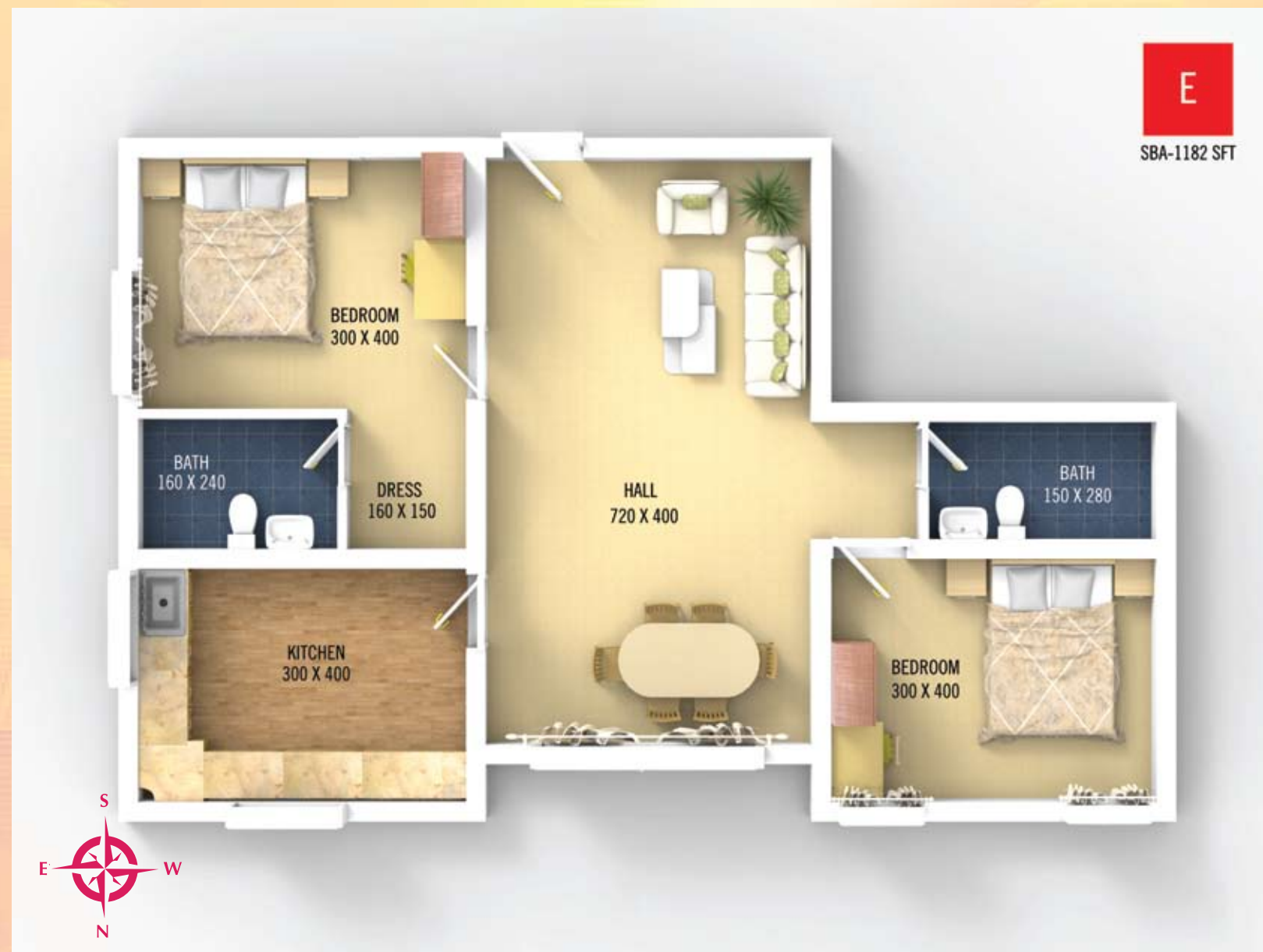
Type E - 2 BHK 1182 sq. ft.