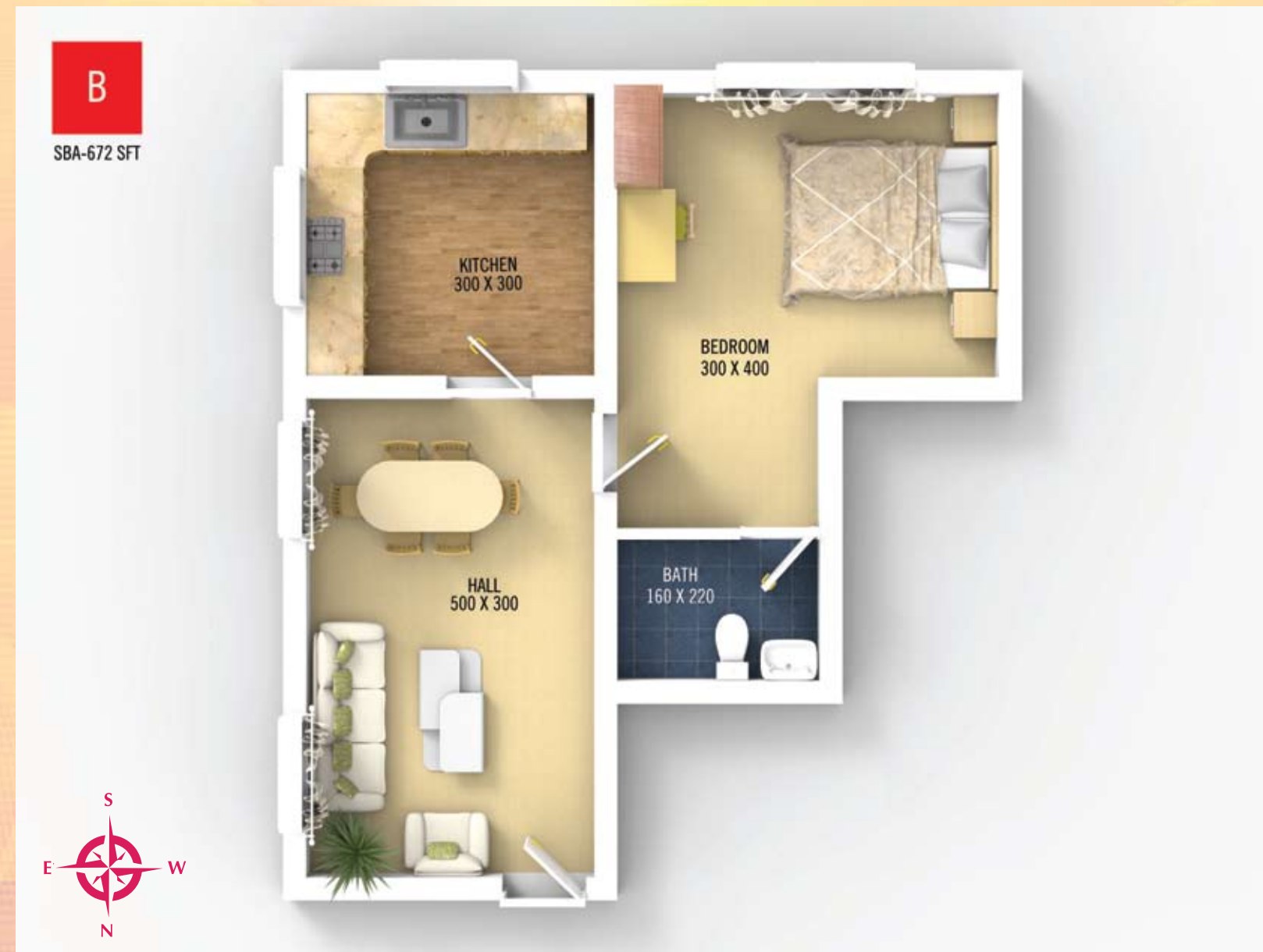
Type B - 1 BHK 672 sq. ft.