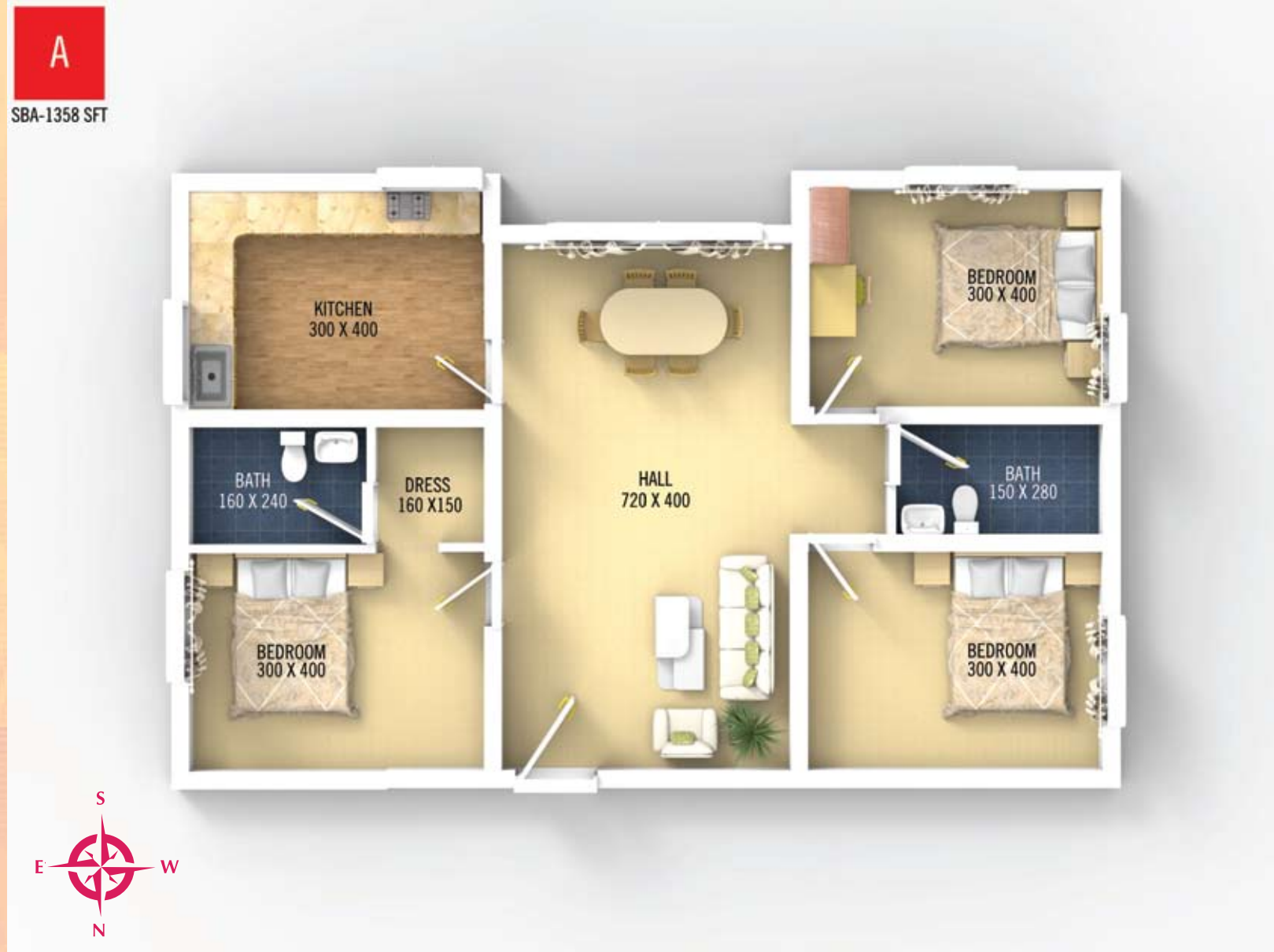
Type A - 3 BHK 1358 sq. ft.