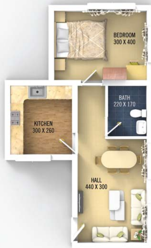
Type C - 1 BHK 627 sq. ft.