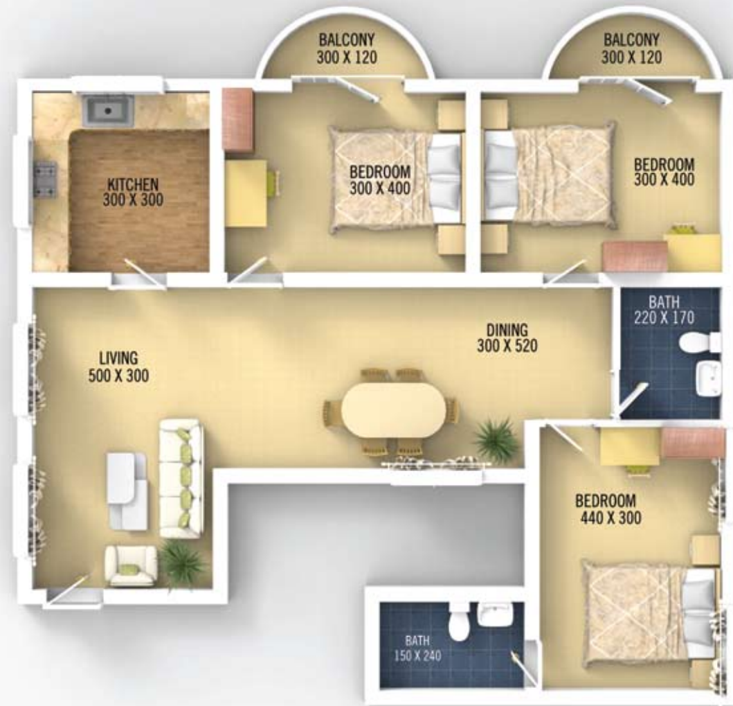
Type G - 3 BHK 1413 sq. ft.