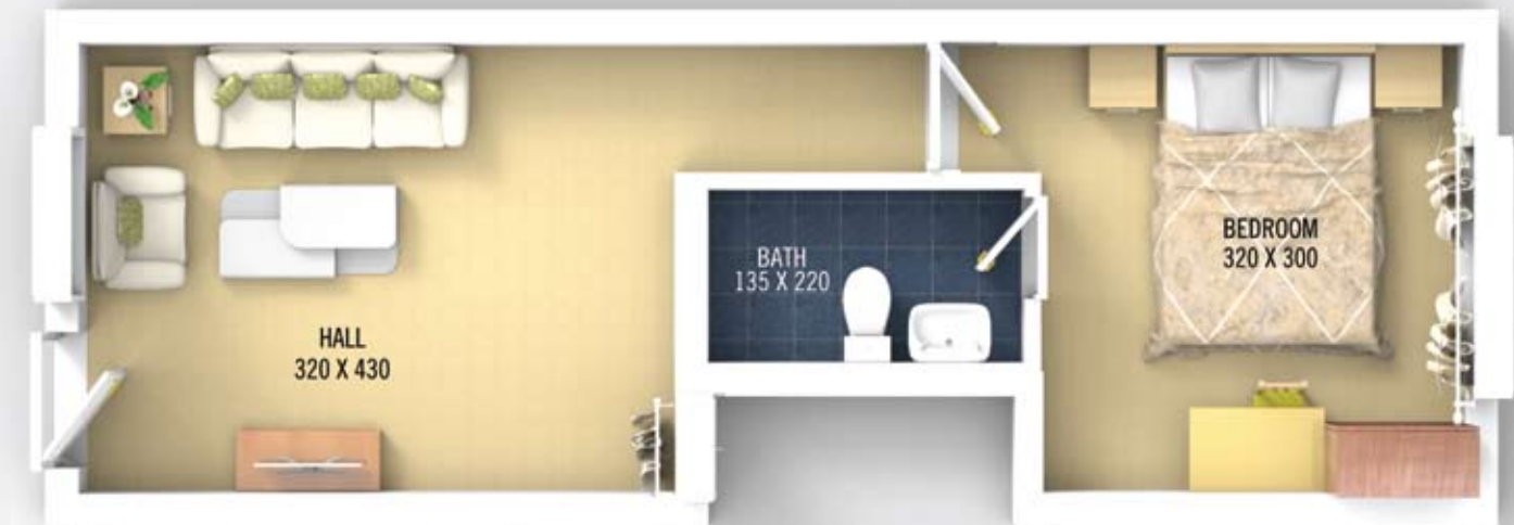
Type H - Single Apartment 464 sq. ft.