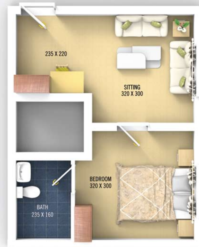
Type D - Single Apartment 471 sq. ft.